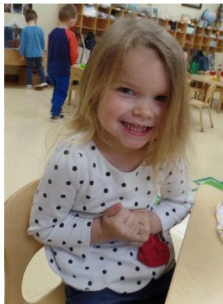
I can be happy!