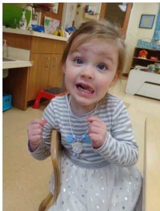
I can be silly!