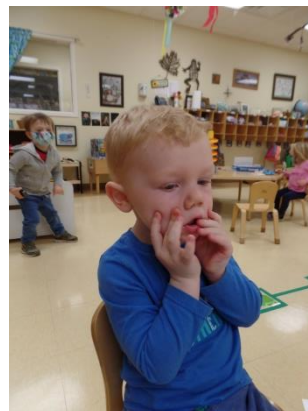
I can be scared!