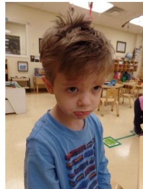
I can be sad!