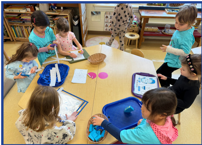
Fine Motor Practice