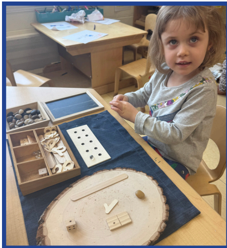
Learning Number 1