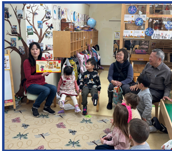
Learning About Chinese New Year