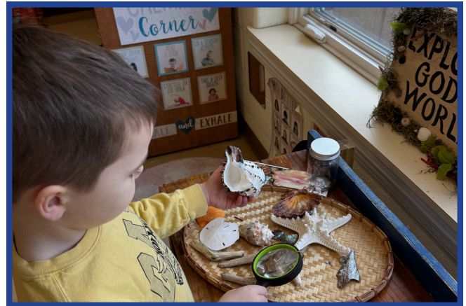
Ocean Science Table