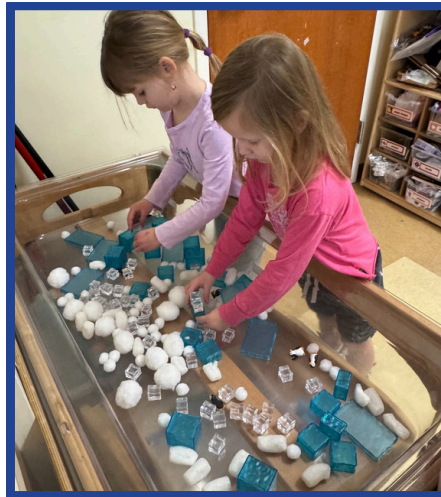
Arctic Animal Sensory Table