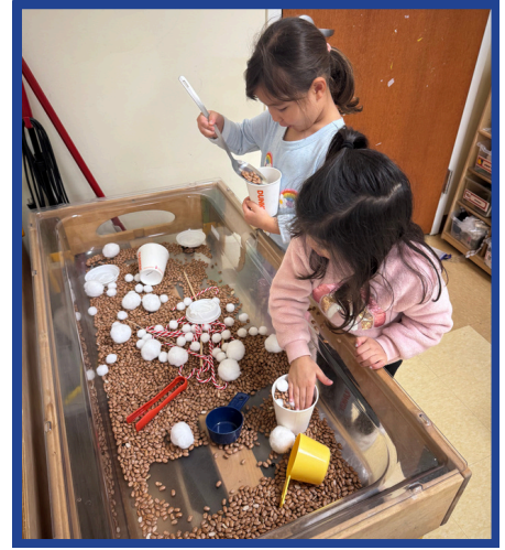
Hot Coco Sensory Table