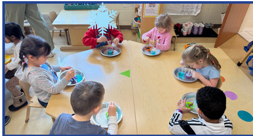
Rescuing the Animals from the ice