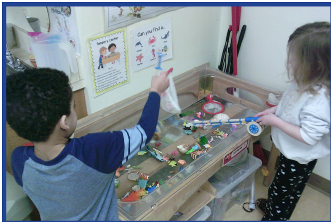
Ocean Sensory Table