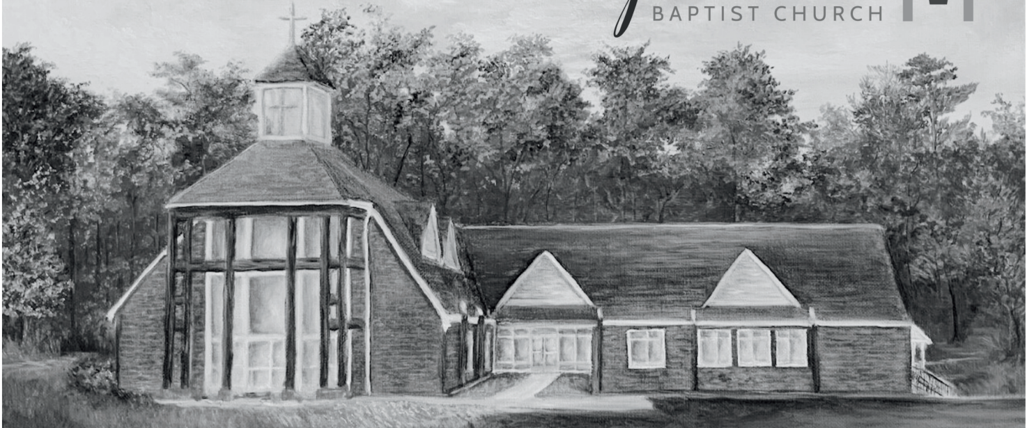
HOPEWELL BAPTIST CHURCH NEW KENT, VA