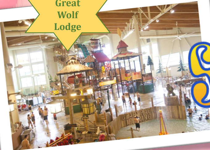
Great Wolf Lodge