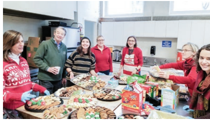
Our fabulous & fun Kitchen Crew pause for a photo at the Christmas party.