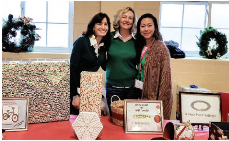
Lovely ladies from the National Charity League man the HOPE holiday raffle table.