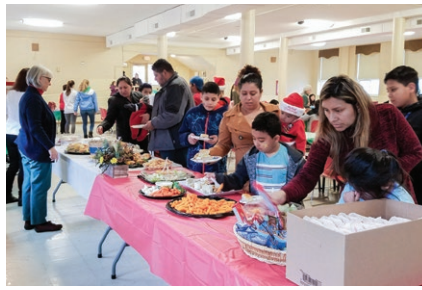
Clients enjoy the holiday spread.