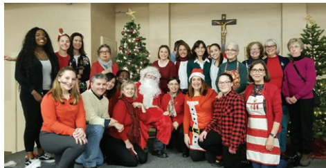
Our awesome group of volunteers pose for a group photo.