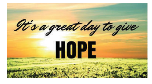
Check out our brand new donor website at hopehousenova.org. Contributions directly support service to our clients, including free counseling, adoption support, material needs (i.e. cribs and diapers), housing references, and parenting classes.