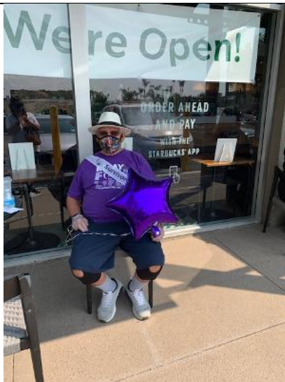
Angel resting at our Stop at Starbucks