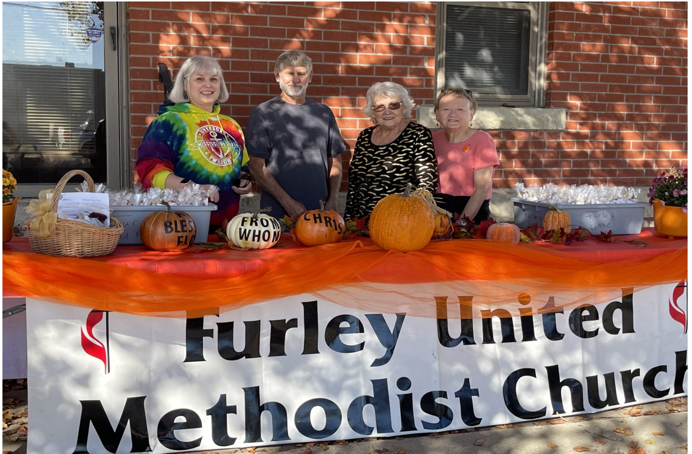
Trick or Treat Street in Whitewater