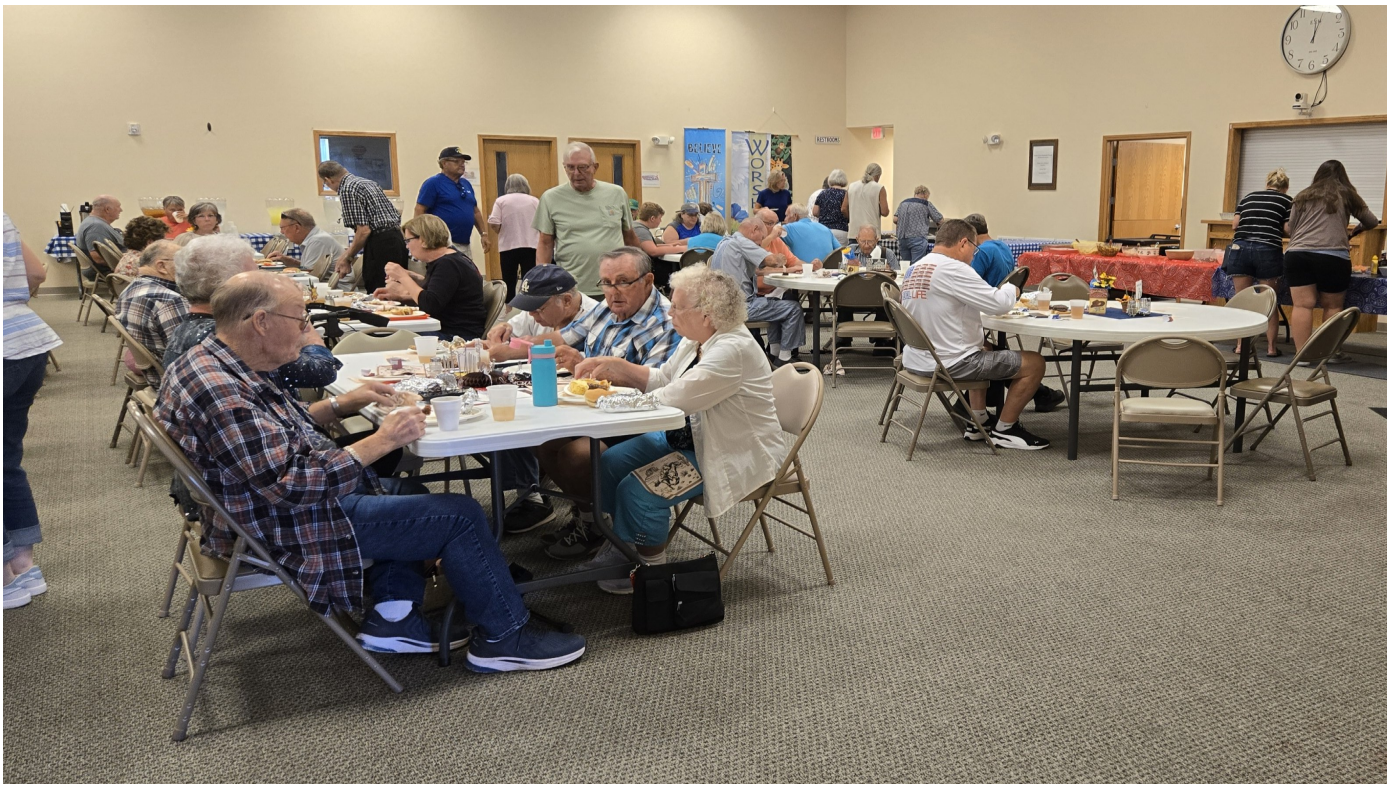
Community Lunch Pictures August 8th