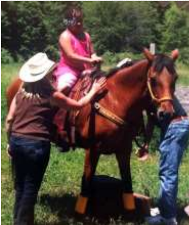
Many Fun & Educational Activities