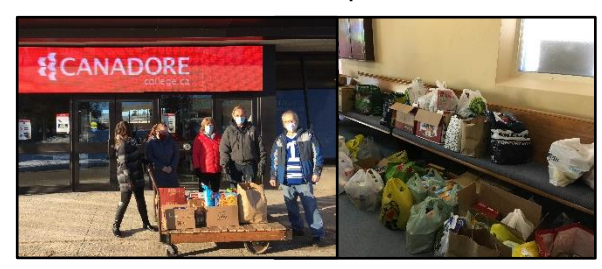
Coldest Night of the Year 2020 supports The Gathering Place