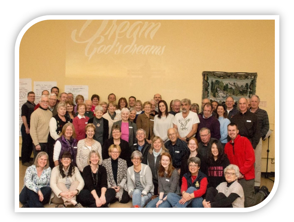
Group who met to "Dream God's Dream" on Saturday, March 7, 2015.