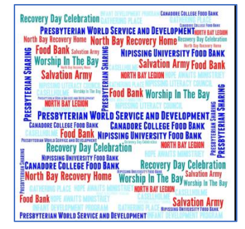
Reverse Advent 2020 Shares with Nipissing University & Canadore Food Banks

Collecting can tabs for wheelchairs—working with the Shriners Club