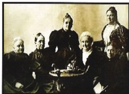
"That Handful of Women"

Featuring Panel of Former Florida Conference Presidents