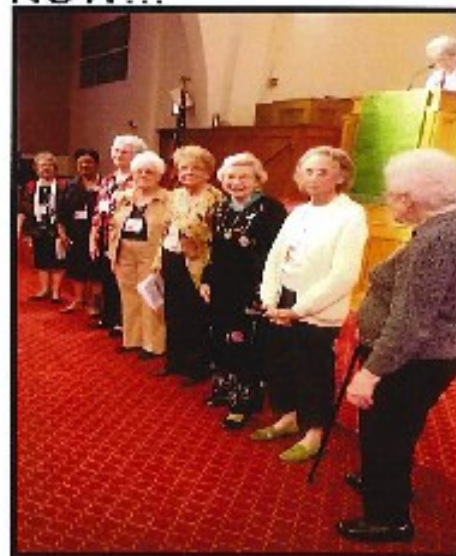
Conference Presidents, Past & Present