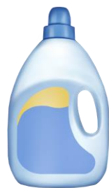
Laundry detergent (adult and baby)