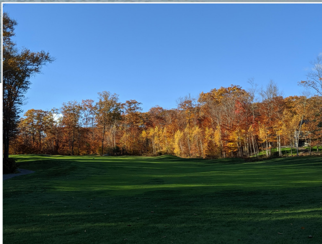
Toddy Brook Golf Course 18th Hole and Fairway