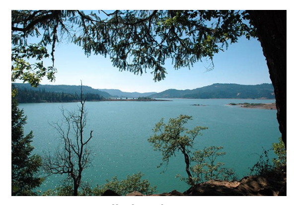
CBC All Church Campout-

July 28-30 at Steward State Park (Lost Creek Lake