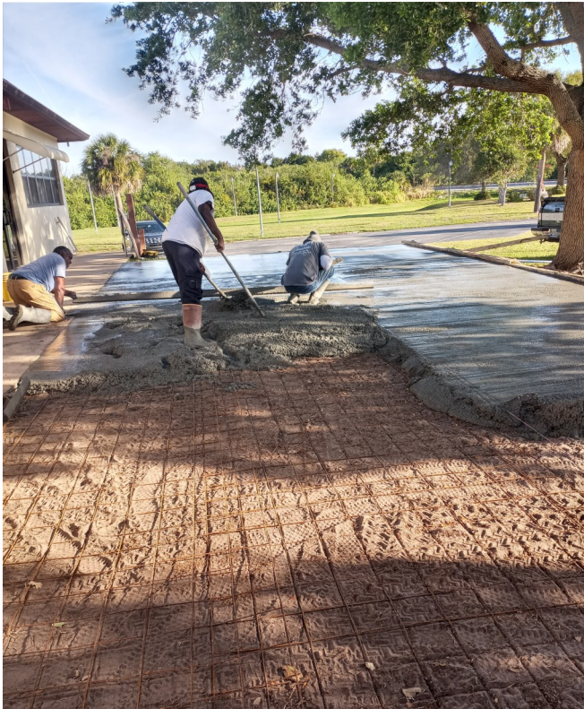
Ground prepping during the Flea Market in the East Parking lot on March 9th Monday, March 11, 2024- the concrete slab was poured