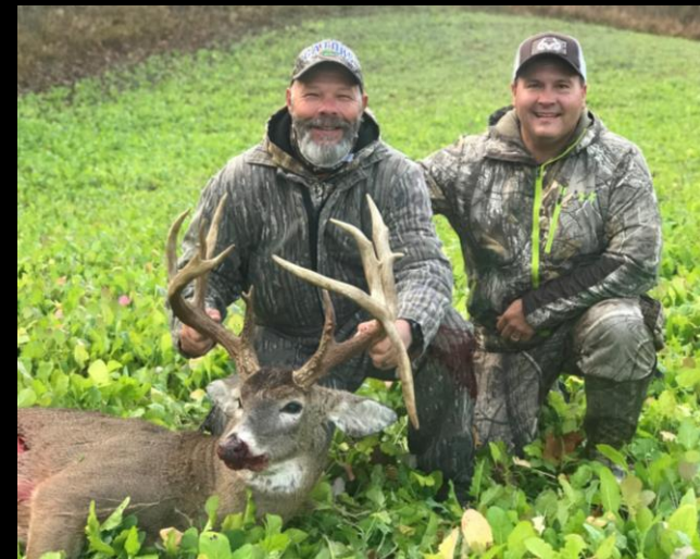
A 2020 buck harvested during an IO retreat on farm we will be hunting