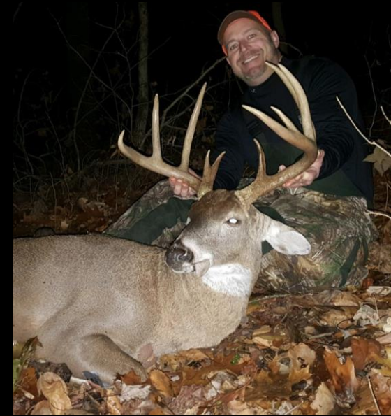
A 2019 buck harvested on one of the farms we will be hunting

These farms and this area are some of the top producing counties in Ohio for trophy bucks.