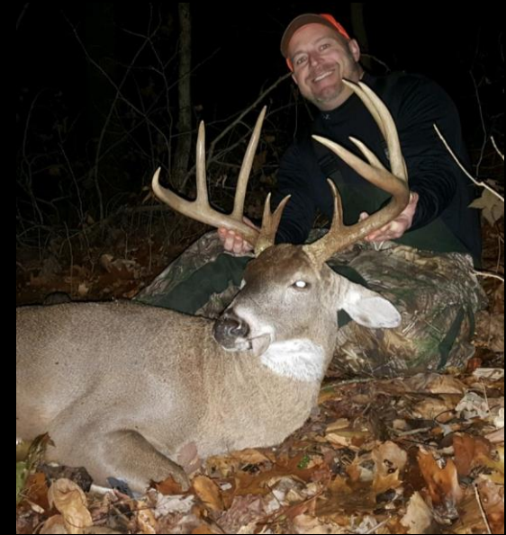
A 2019 buck harvested on one of the farms we will be hunting

These farms and this area are some of the top producing counties in Ohio for trophy bucks.