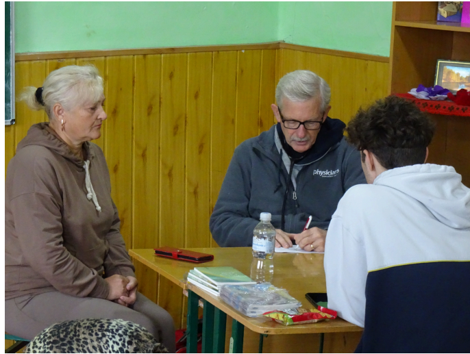
At the refugee center in Ukraine