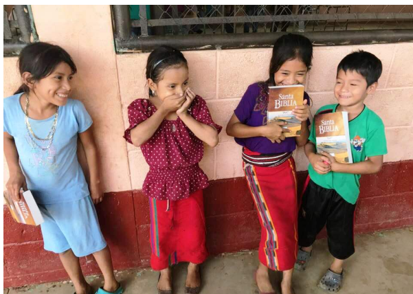
Guatemalan Children Receive Bibles