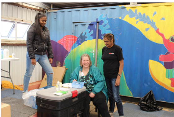
Pharmacy in South Africa