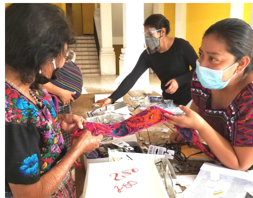
Glasses given in Guatemala