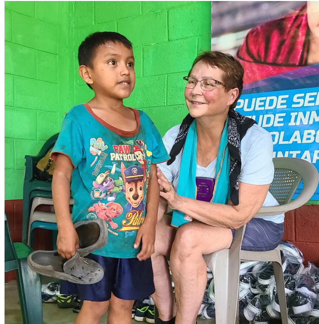
Feeding children in South Africa New shoes in Guatemala