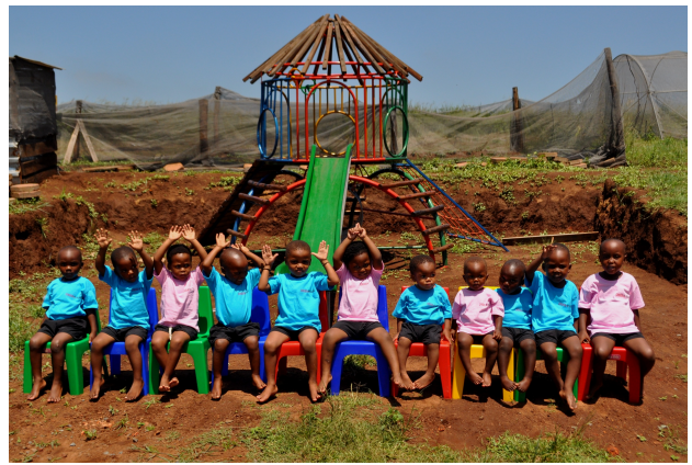
New Uniforms for the Educare