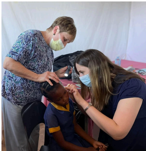
Checking an ear in South Africa