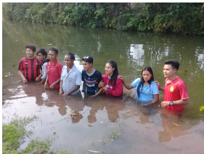
Lao believers being baptized