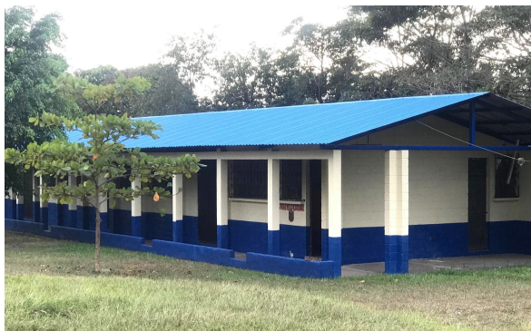
New Roof in Guatemala