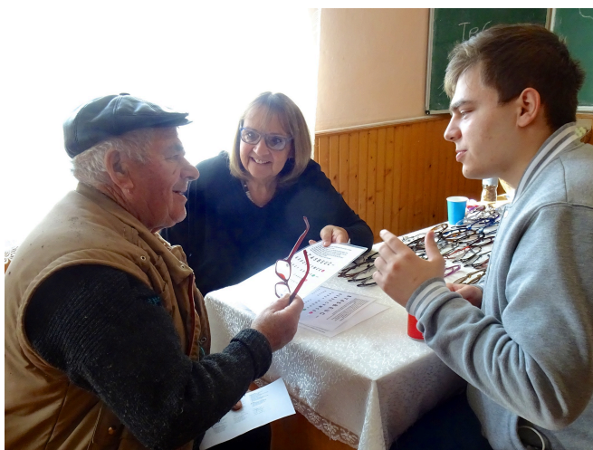
Fitting Reading Glasses in Ukraine