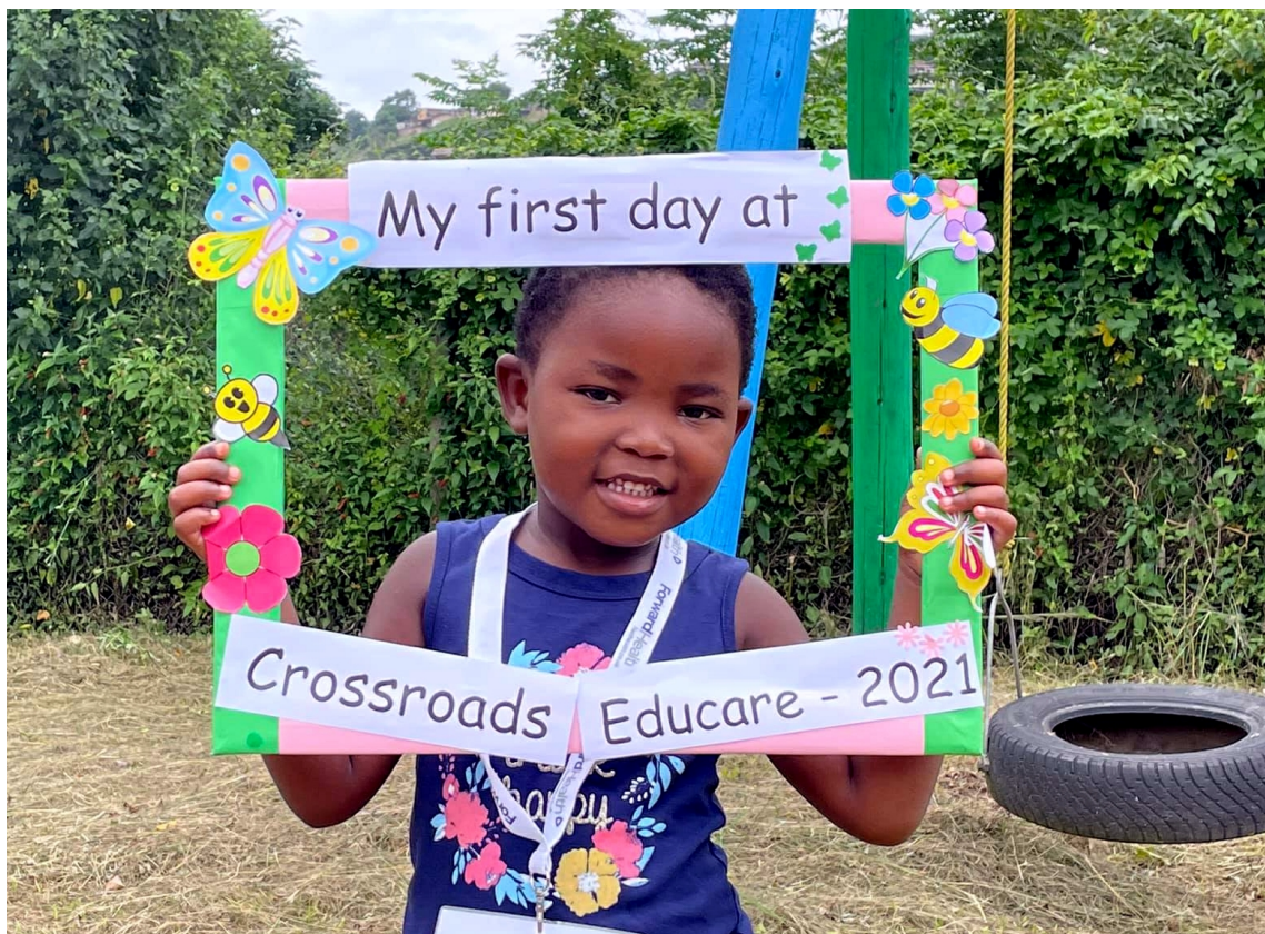
Support for the Educare in South Africa