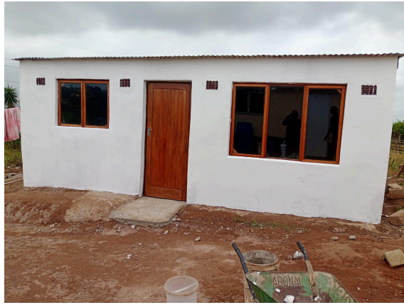
One of our college graduates in Laos House project in South Africa