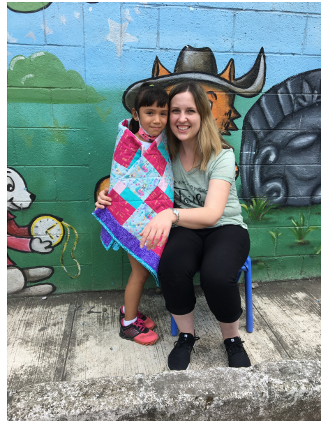
El Rodeo children received quilts