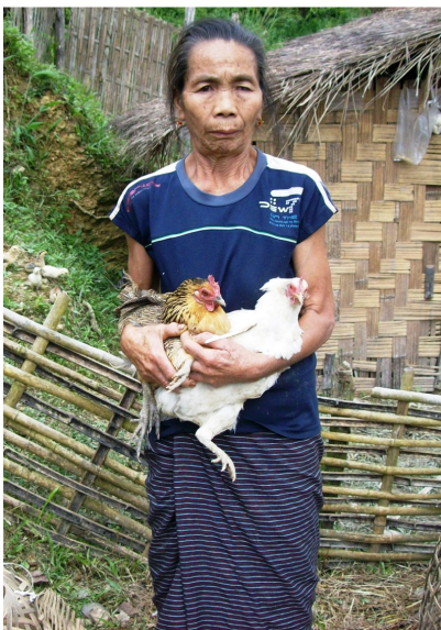
Support for Lao Widows