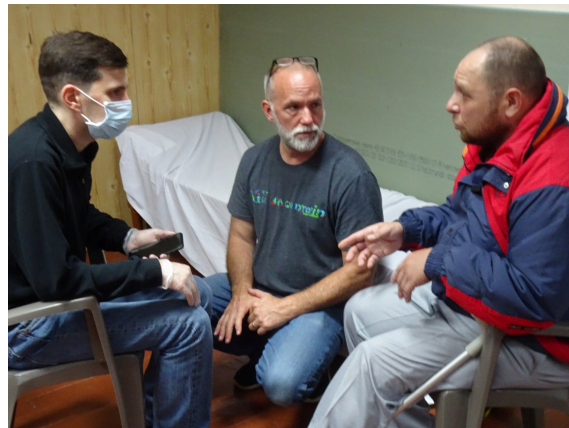
Physical Therapy in Ukraine