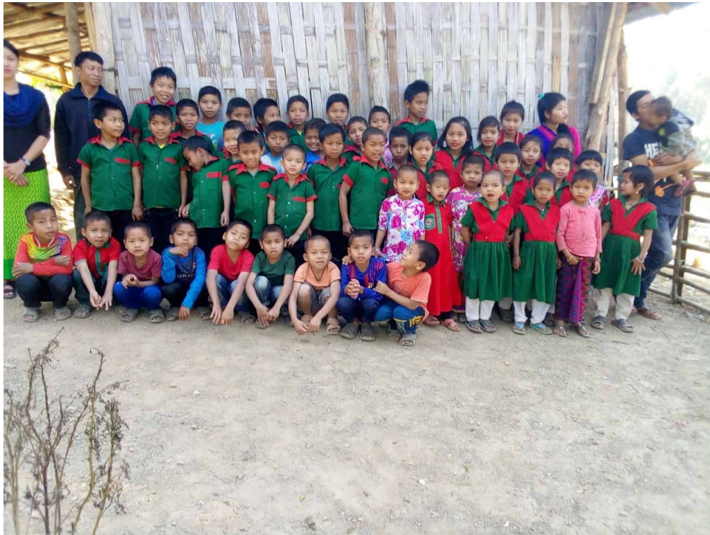
Mercy Home Kids in Bangladesh