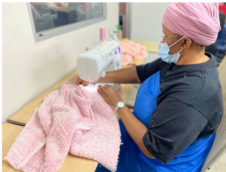
Sewing Project in South Africa