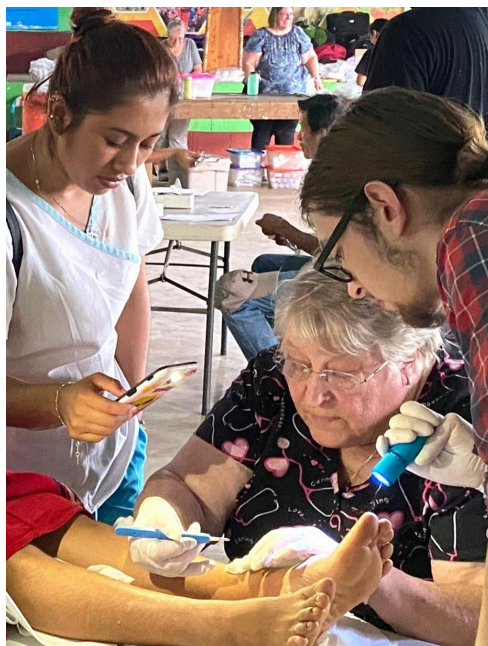
Treating warts in Guatemala