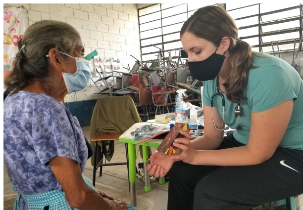
Sharing the Gospel