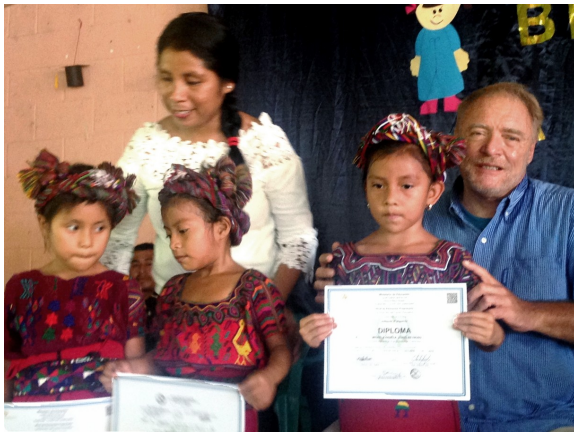
El Tesoro students graduate