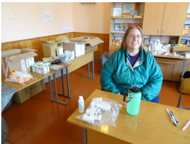
Pharmacy in Ukraine