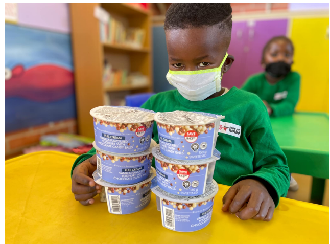
Food at the Educare, South Africa