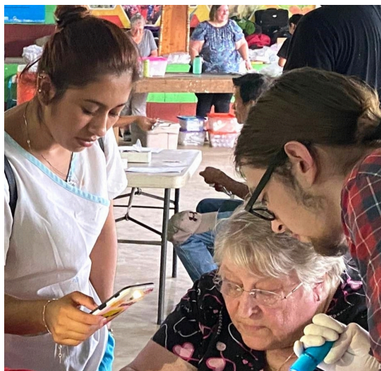
Minor surgery in Guatemala