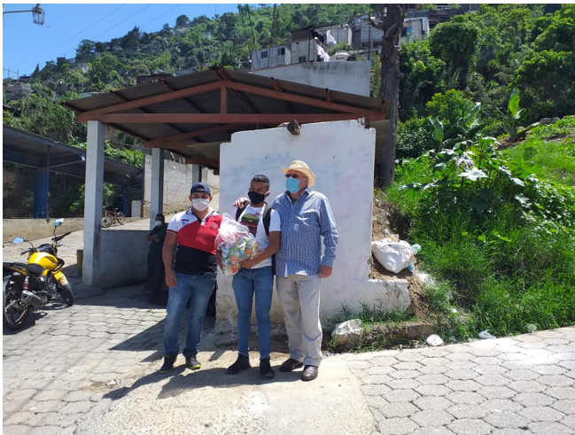
Delivering Food in Guatemala