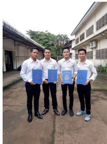
4 of our Graduates in Laos