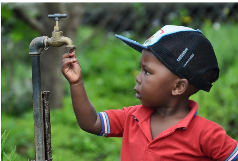
One of our college graduates in Laos Water Tap for South Africa