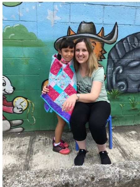
El Rodeo children received quilts