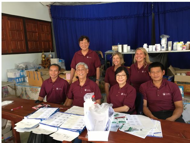
Our pharmacy Team in Thailand