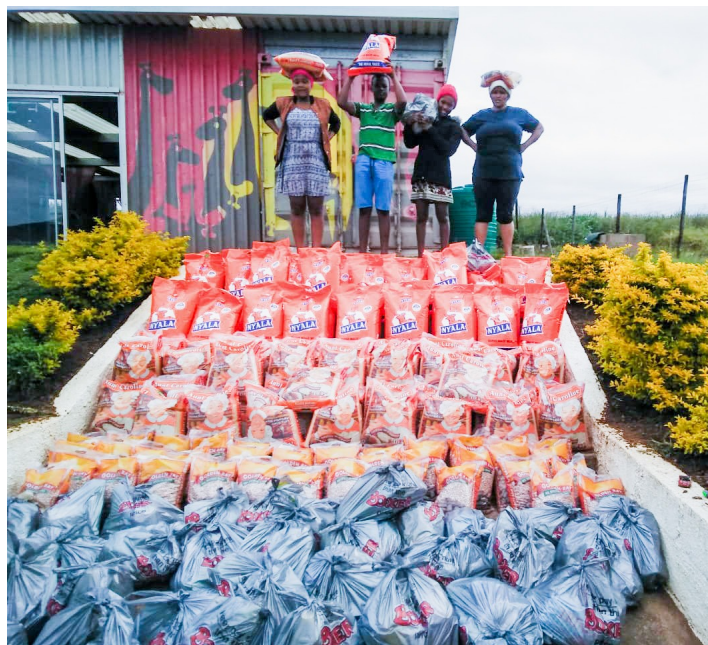
Food Distribution Hope Center