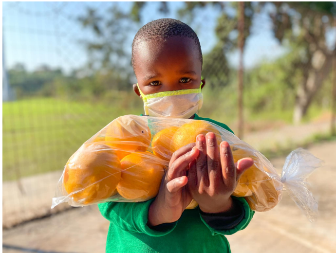
Oranges for kids