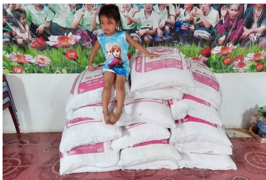
Lao Christians receiving rice