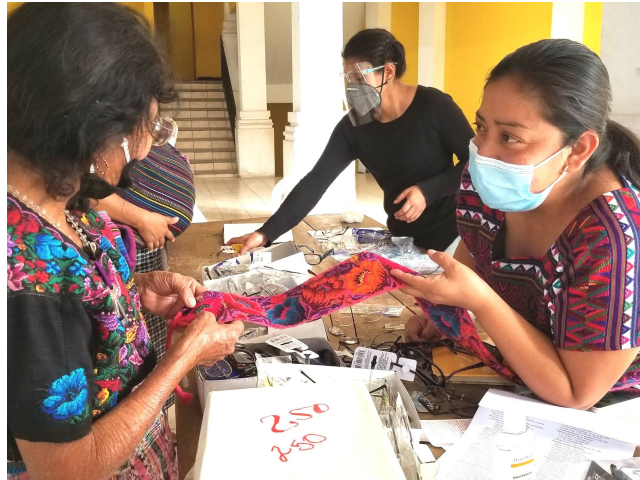
Glasses in san Antonio AC