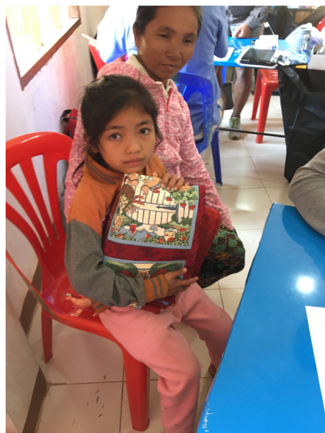
Lao Child Receives a Quilt