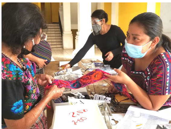
Glasses in Guatemala