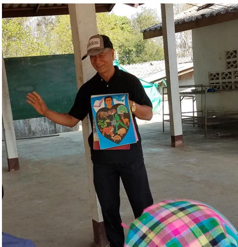
Gospel presentation in Thailand