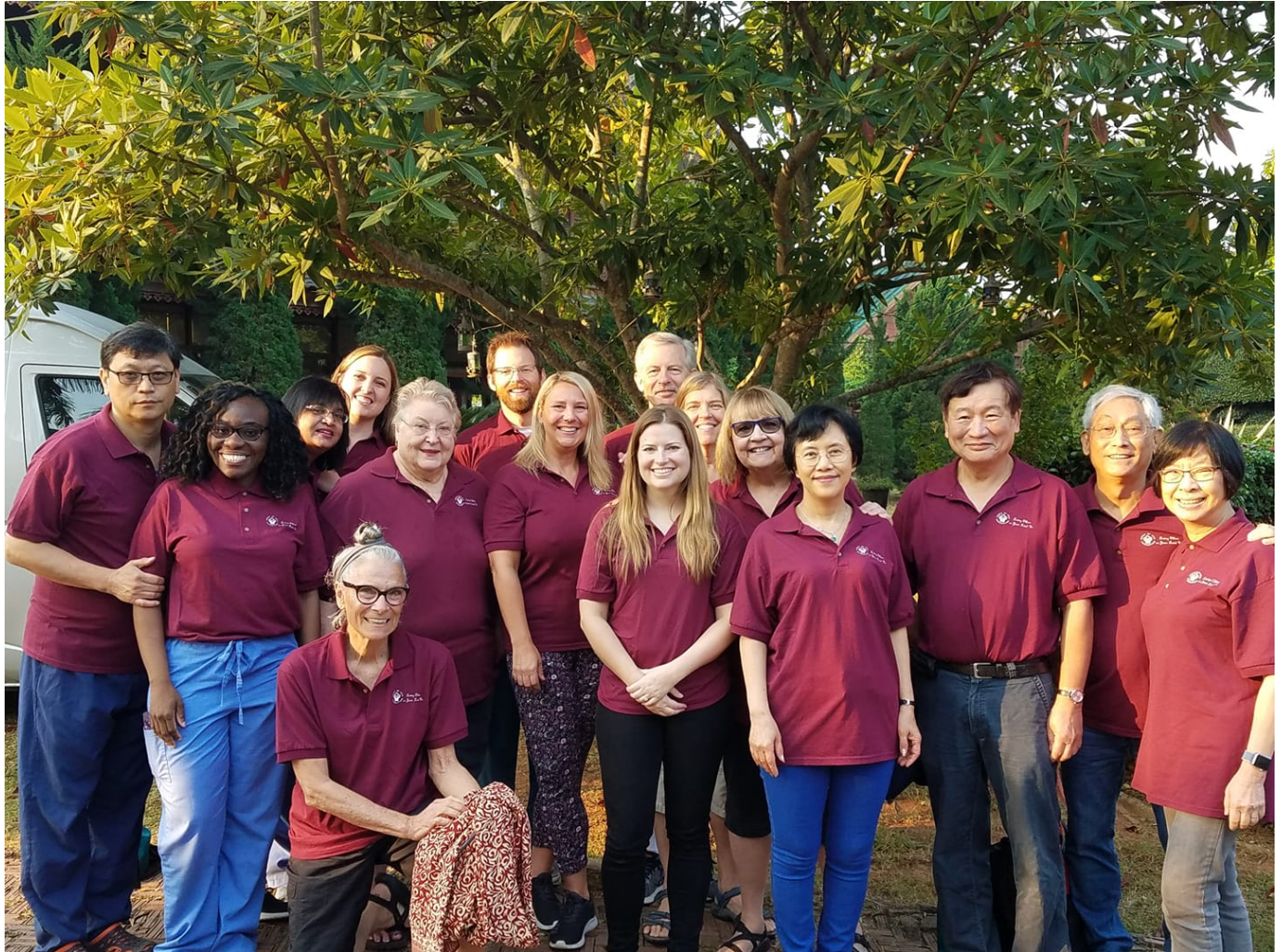
Our Thailand 2020 Team