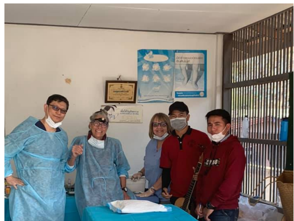
Dental team ready for patients