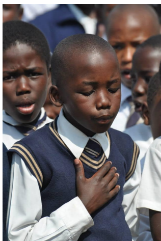
South African Boy Worships