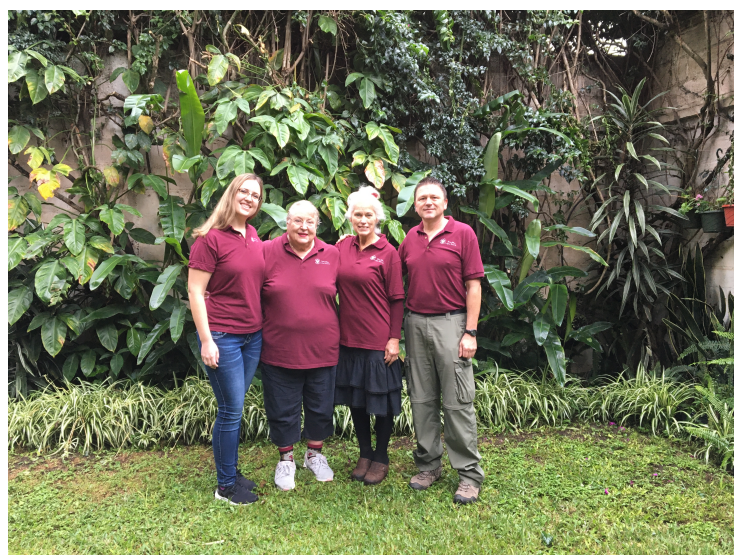
Our November 2020 Guatemala Team