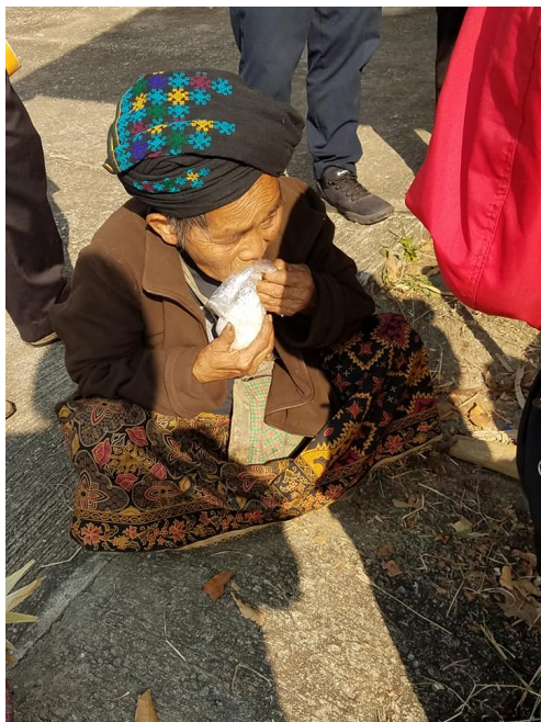
Feeding patients at our Thai clinic