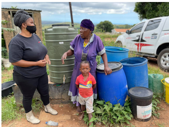
Water Tank for a Family