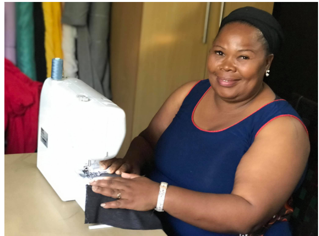
Sewing Masks in South Africa