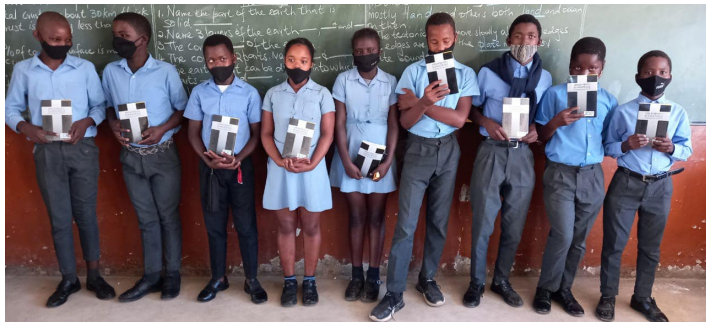
Students Receive Bibles