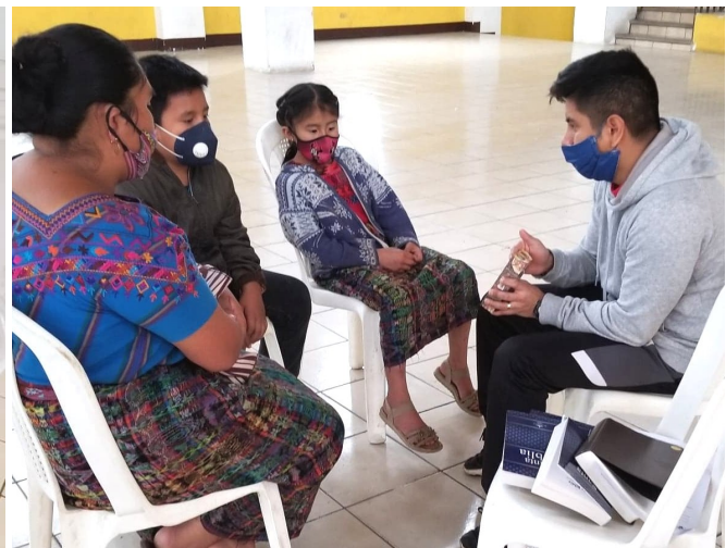
Sharing the Gospel and Prayer in San Antonio AC