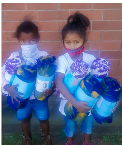
South Africa kids Receive Blankets