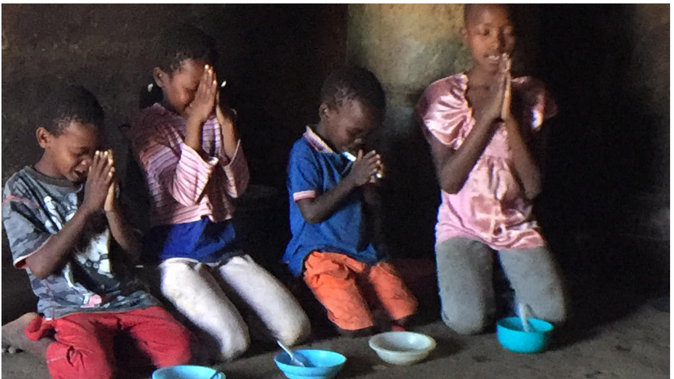
South African Family Prays for Food