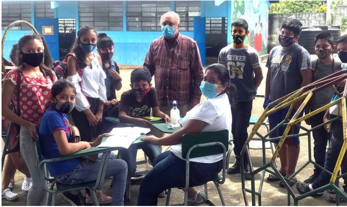
Tutoring Kids in El Rodeo