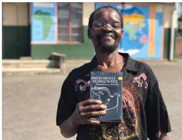
Man receives a Bible