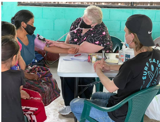
Working in Guatemala