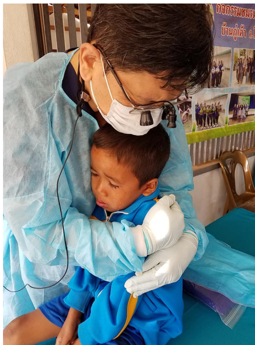
Dr Phil Comforts a Child