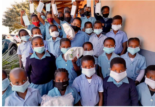
South Africa Schools Mask Up