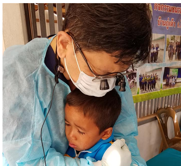
Dr Phil comforting a patient