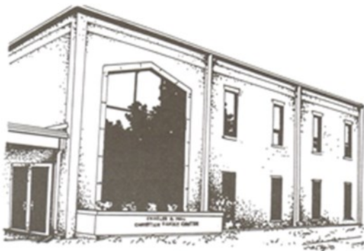
The Charles E. Mull Christian Family Center