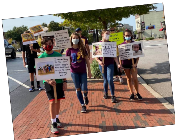
"Virtual" Walkers: 2020 CROP Walk