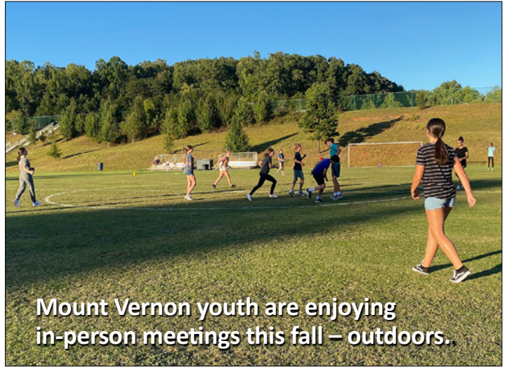
Mount Vernon youth are enjoying in-person meetings this fall – outdoors.