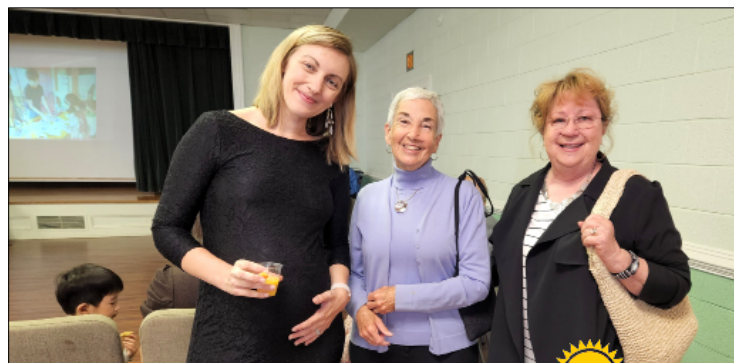
May 1: Great food and fellowship at the Reconnection brunch.

As the old song says, many have found renewed "faith, hope, and charity" at Mount Vernon since Lent season began on March 2. Enjoy the photos taken during Lent and Easter, throughout this newsletter.