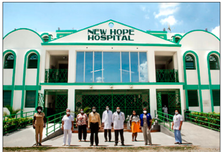
Staff at New Hope Hospital