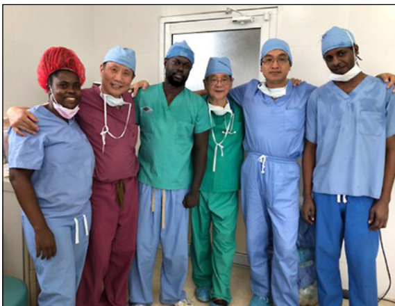
Volunteers and staff at New Hope Hospital

Partners for New Hope, located in Charlotte, N.C., coordinates aid to New Hope Hospital and the surrounding area. They insure that supplies, volunteers, food, etc. arrive in a way that does not cause shortages or over supply (e.g., ten volunteer doctors arrive one week and none the next). There are 25 members, 11 of which are churches, and of the churches, 6 are United Methodist.