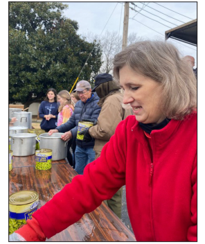
The stew sale benefits our youth Appalachia Service Project (ASP) summer mission trip.