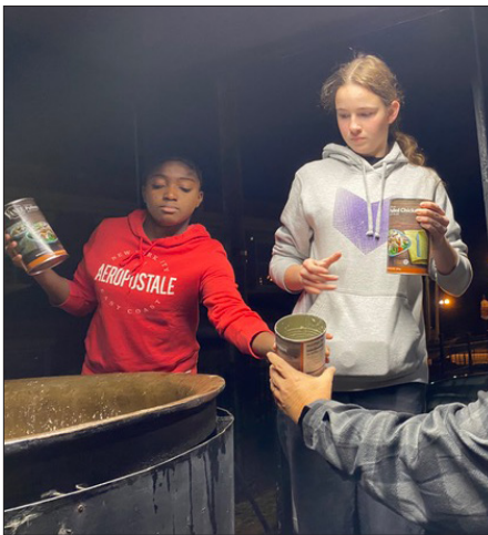
Cooking Mount Vernon's Brunswick stew starts before daylight