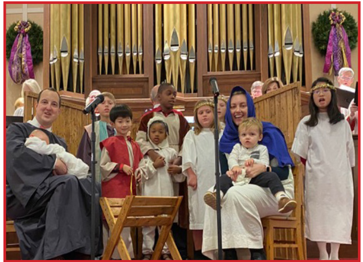
"Musical Celebration of Christmas" – Dec. 11