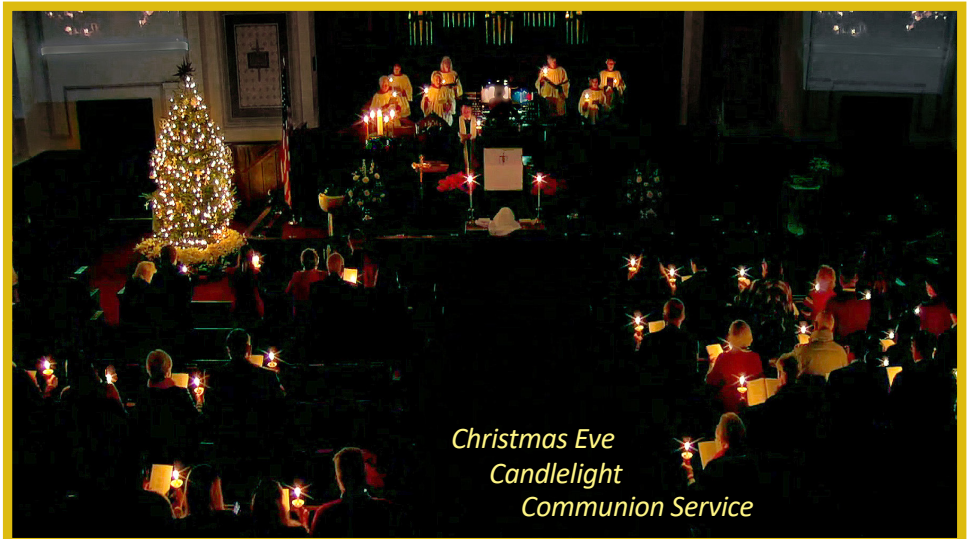
Christmas Eve Candlelight Communion Service