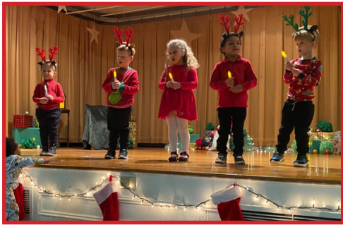
Children's House Christmas Pageant