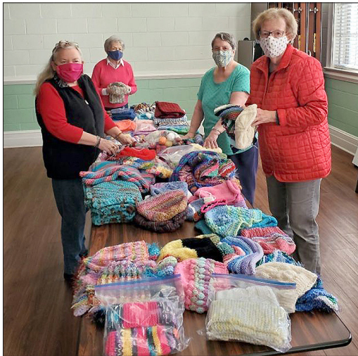
Some of Mount Vernon's knitters sort items for the Cherokee Indian mission.