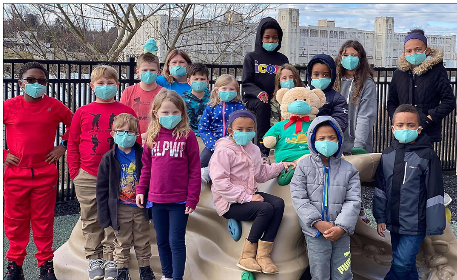
The Advent Offering: Half goes to the YMCA scholarship program, half to Habitat for Humanity.