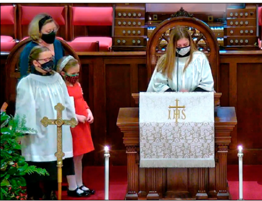
Christmas Eve Candlelight Communion Service