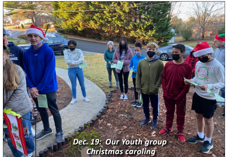
Dec. 19: Our Youth group Christmas caroling