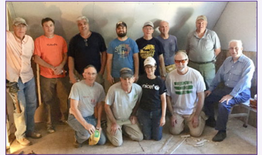
Mount Vernon team installs sheetrock in a Habitat house

Habitat for Humanity, The Habitat Village Project. The Habitat Village Project will provide 30 homes, in one neighborhood, for families looking for better living conditions. One quarter of the land will be dedicated as community space for all the residents. This will allow families to focus on things like work, school, and well being.