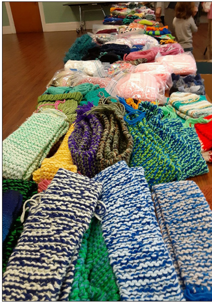
Left: Fifty hat-and-scarf sets!