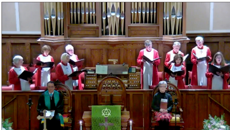
The Aldersgate Choir