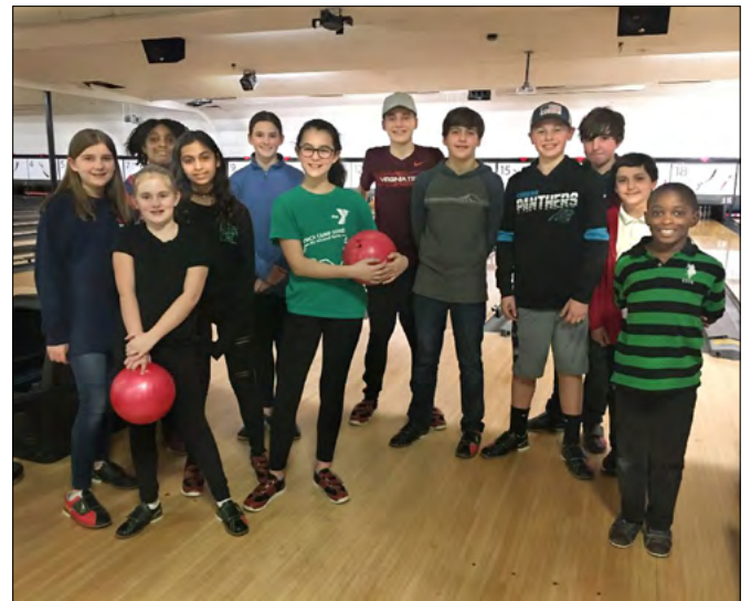
Before the coronavirus, our younger youth enjoyed bowling together.