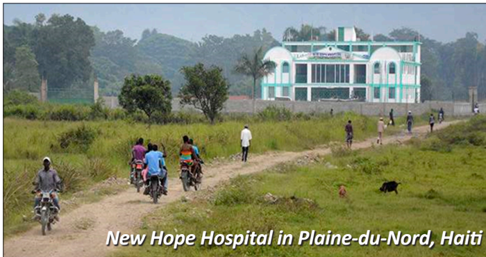
New Hope Hospital in Plaine-du-Nord, Haiti

This offering from Mount Vernon will be sent to New Hope Hospital with the goal of improving the health of people in that area of Haiti. Thank you, Mount Vernon, for your financial contributions.