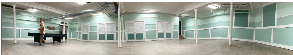
At left: Children's House kids in the renovated space. Above: Panorama, multi-purpose room