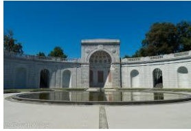
Women's Military Memorial

Become a “Full Moon in June” Sponsor for our June 13th Event!