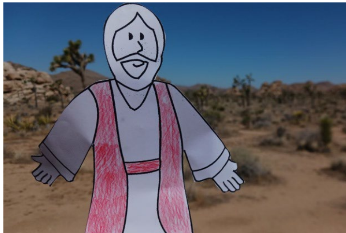
With the Busches at Joshua Tree June 2024