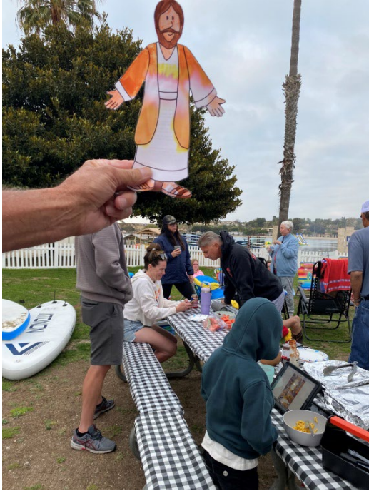
With the Coxes at Newport Dunes June 2024