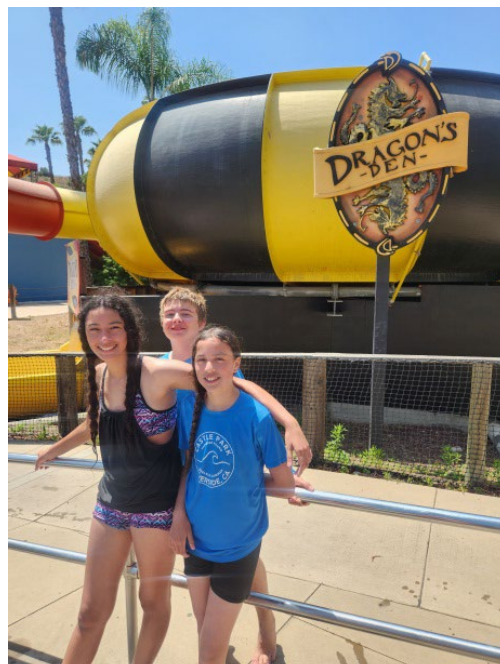
Raging Waters the beginning of June