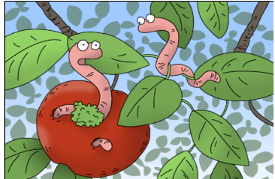
(See Genesis 3)