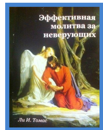
RUSSIAN TRANSLATION 20,000 Copies Printed in Moscow Russia...