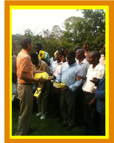
TRIP to Zimbabwe, South Africa A life changing journey...

"I have seen over 100 souls saved in the last 6-8 weeks using your book." D.H. in Kansas